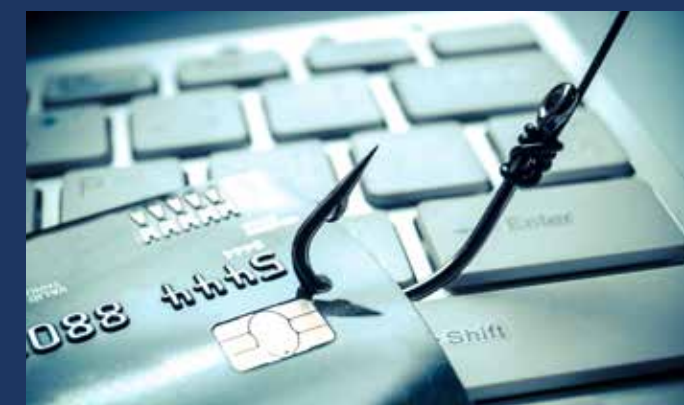
Financial Crime has become a growing threat to economic and social stability