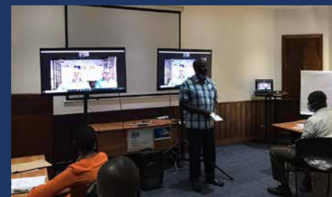
Financial investigation training in Kenya delivered through Virtual learning Platform during the COVID-19 Pandemic