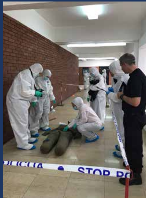
DVI training in Croatia