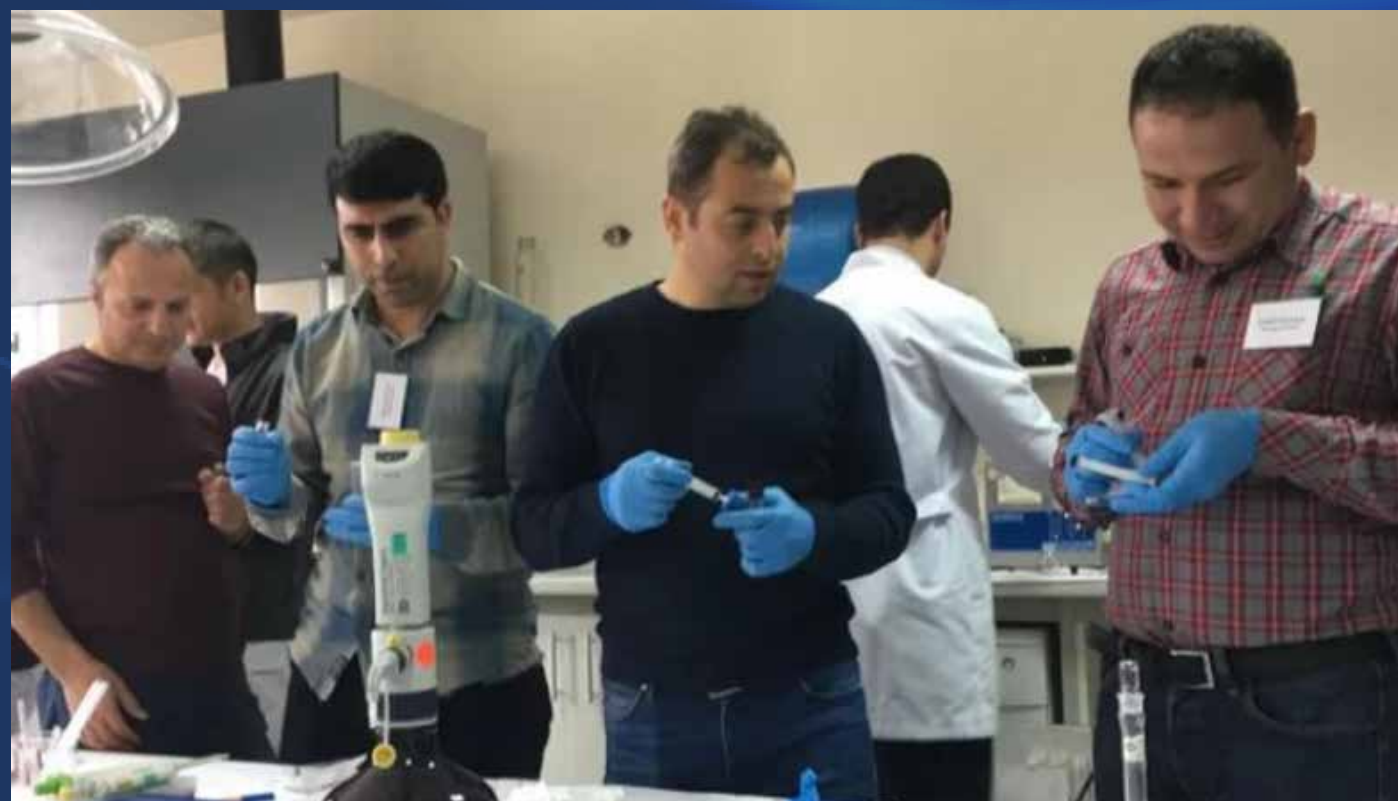
Training Delivery for the Forensic Drugs Project in Turkey