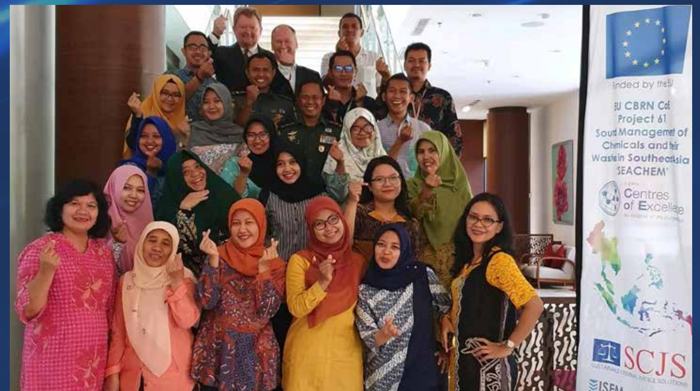
Project 61 delivery in Cambodia