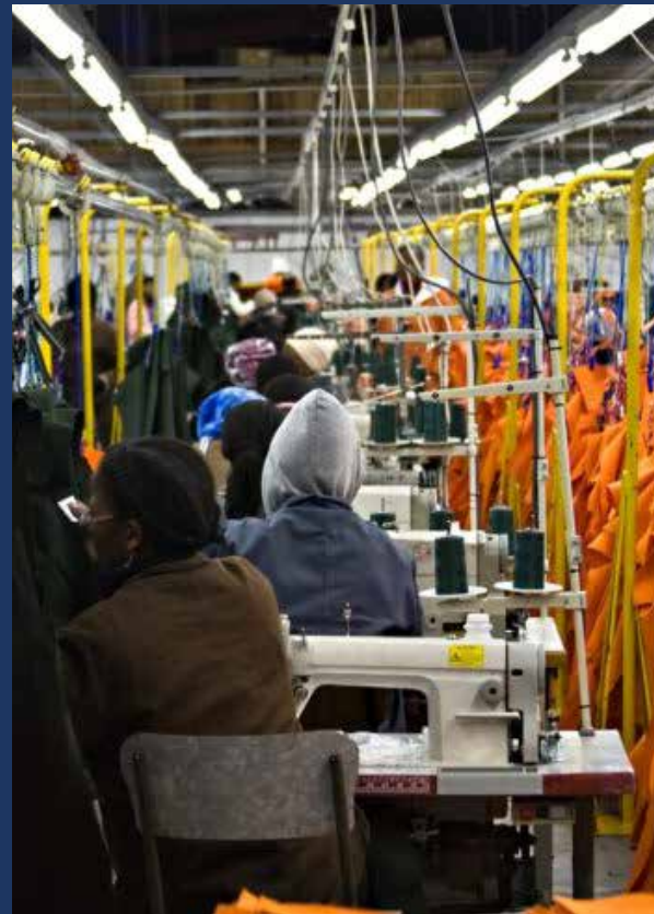
Modern slavery is all around us, but often just out of sight