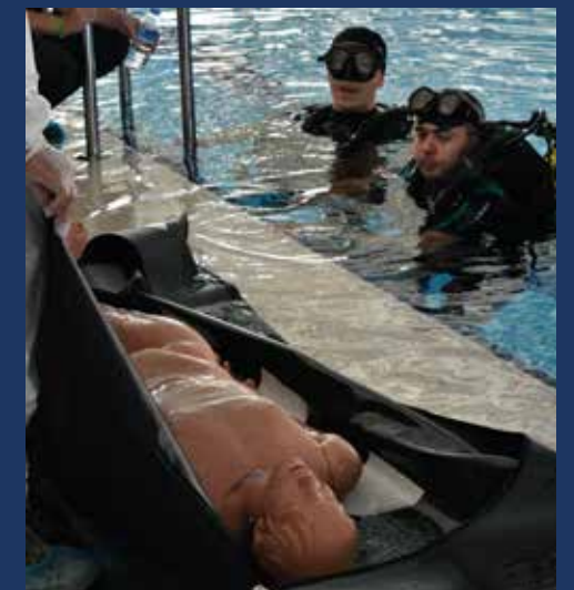
Body recovery training