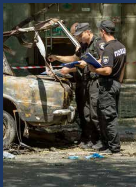
SCJS delivers Counter Terrorism training globally