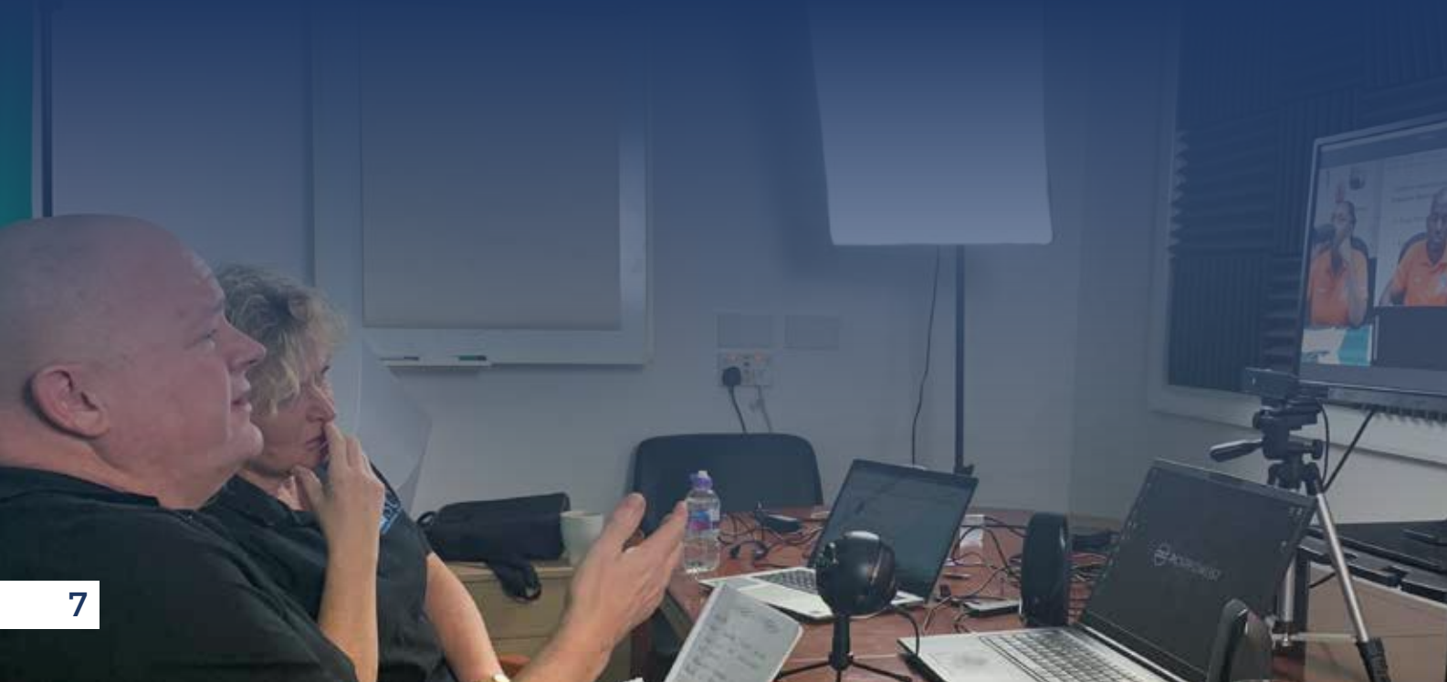
Remote Crime Scene Investigation Train the Trainer Course being delivered by SCJS Experts to the National Security Training Academy - Trinidad and Tobago