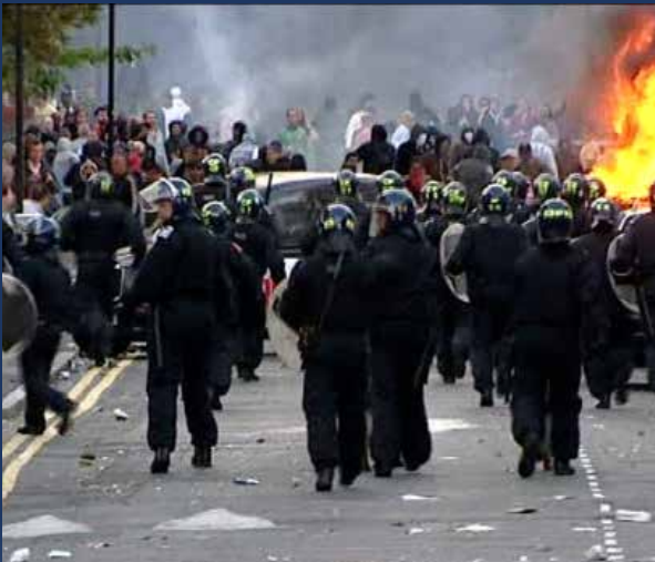
Crowd control measures in public environments