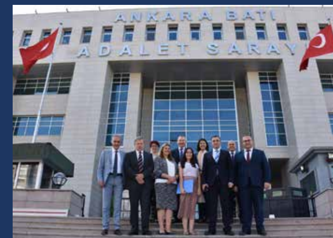
Pilot Courthouse visit - Ankara West Courthouse: Increasing Efficiency of Auxiliary Staff in Judicial Services and the Quality of Trainings