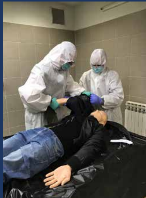
Mortuary processes following body recovery