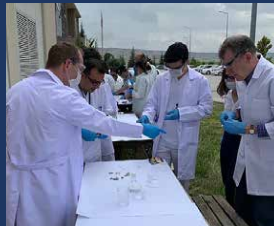
Police Drug Profiling Training Delivery in Turkey