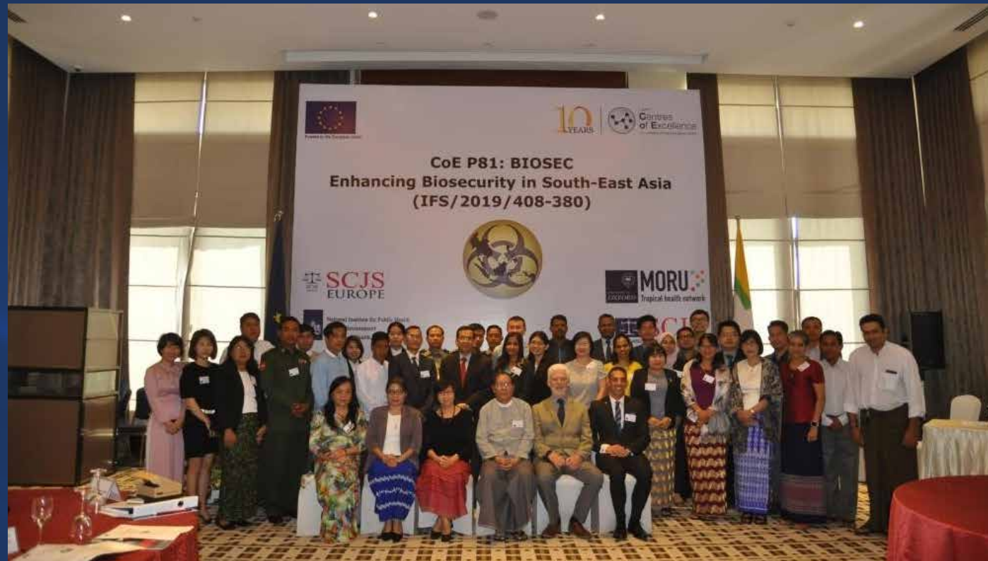
Project 81 CoE ASEAN Conference in Malaysia