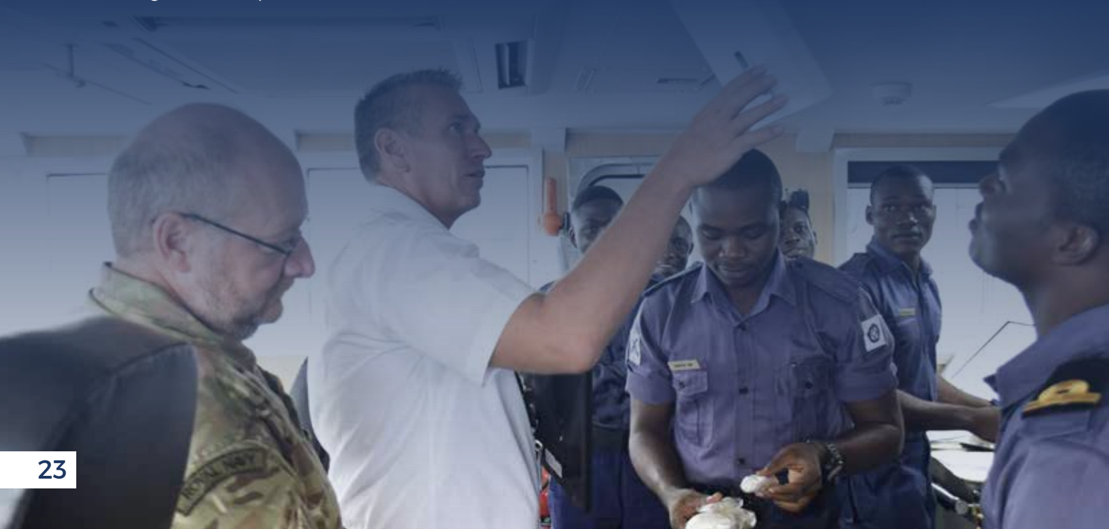
SCJS training the Nigerian Navy in search and investigation techniques