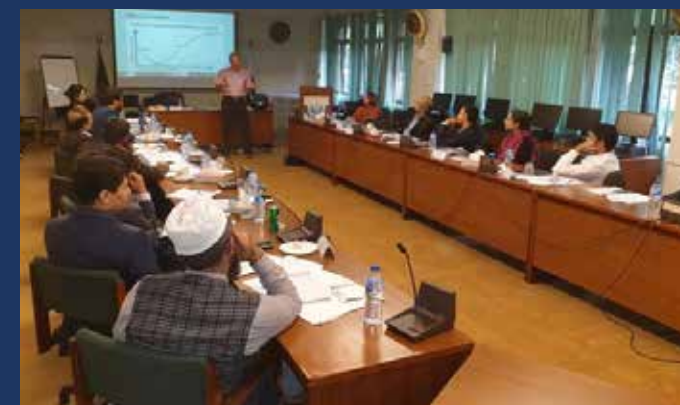
Countering organised immigration crime training delivery in Pakistan