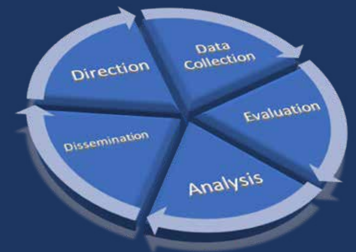
The Intelligence Cycle