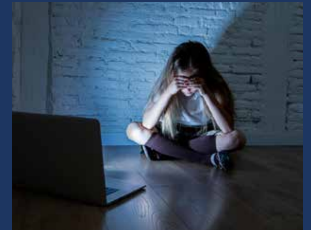
Co-ordinated and consistent approach must be developed to effectively respond to the threat of child abuse and exploitation