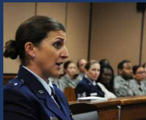
SCJS will provide court room training to suit the needs of the individual