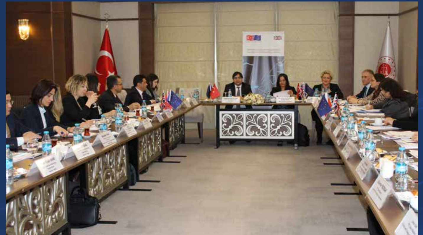
Third Steering Committee Meeting for the Judicial Notifications Project in Turkey