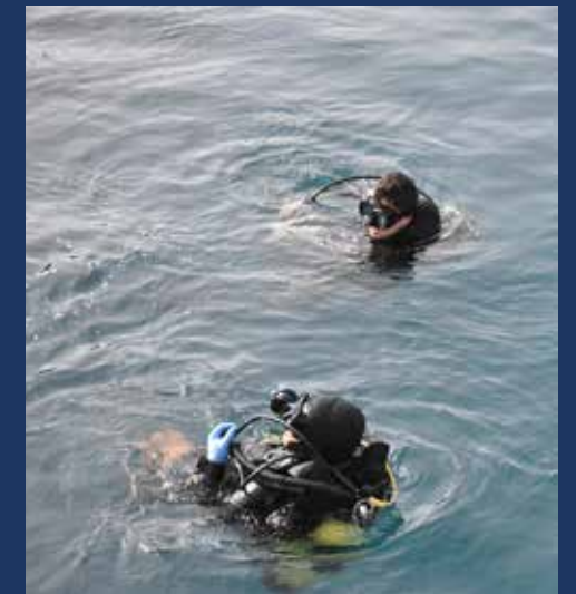
CSI Coastguard training in Turkey