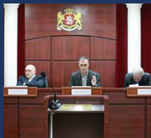
Court Room Skills training in Georgia