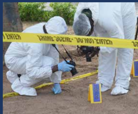
CSI Training delivered to the Nigeria Air Force