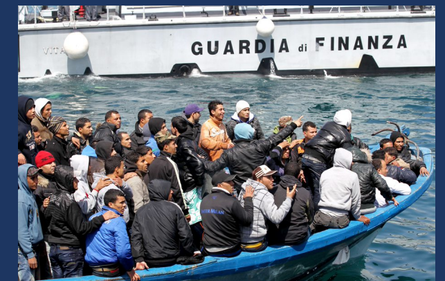
The smuggling of migrants is an increasing phenomenon exploited by organised criminals