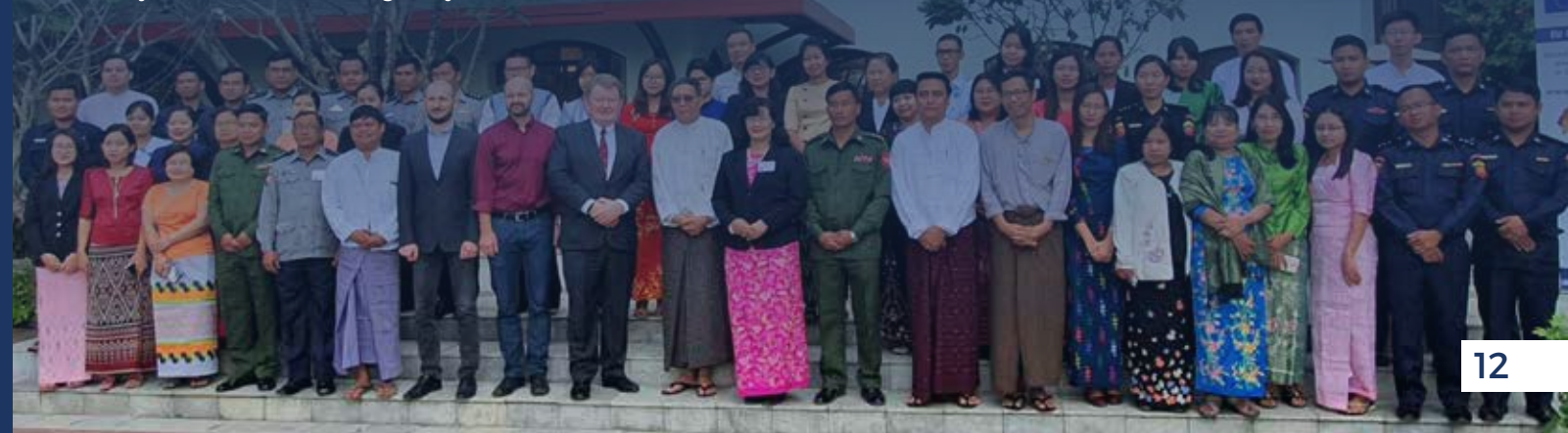
Project 61 National Training in Myanmar