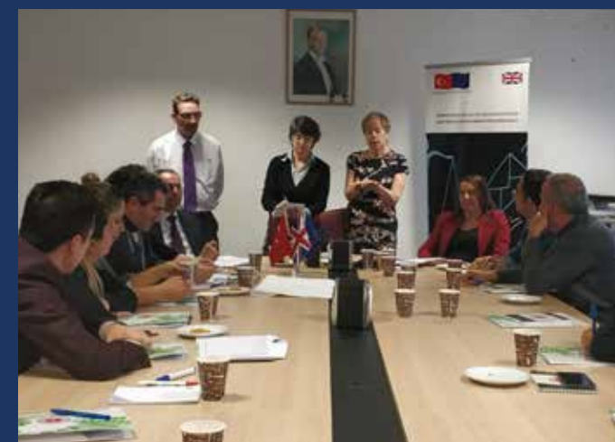
SCJS conducting a Training Needs Analysis as part of the Judicial Notifications Project in Ankara, Turkey